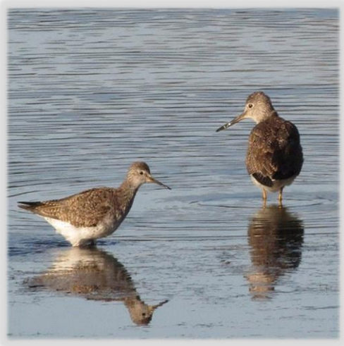
Lesser and Greater Yellowlegs