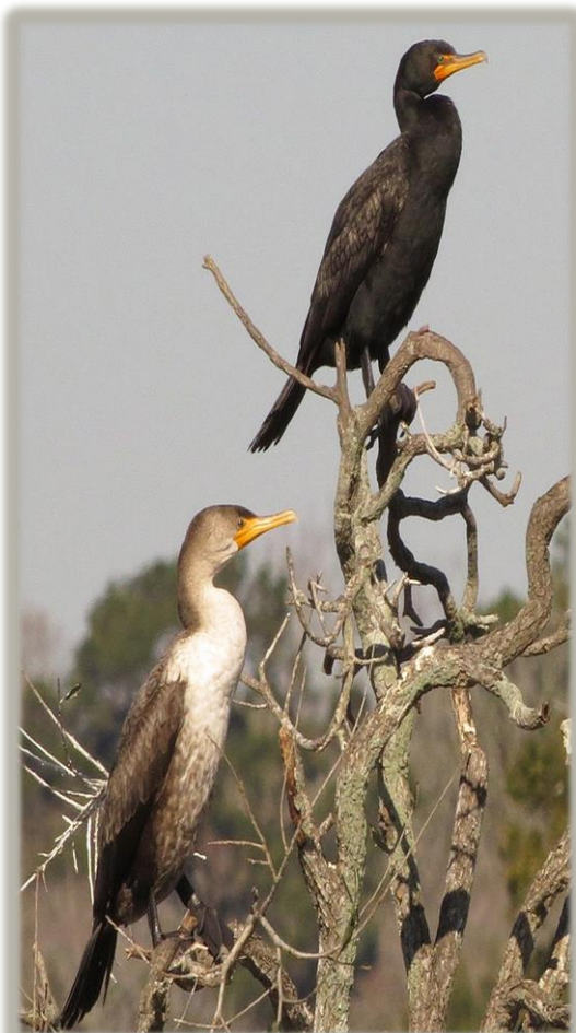
Double-crested Cormorants adult (top) and juvenile (lower)