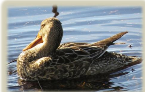
N. Shoveler, female