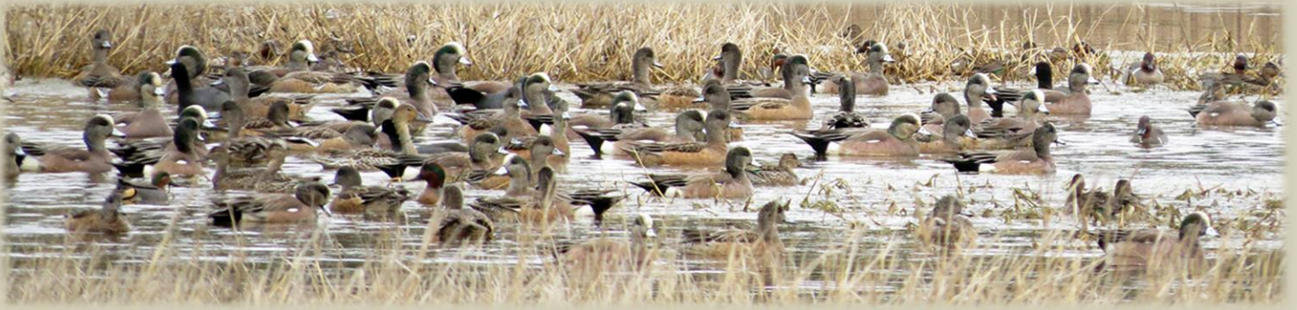
American Wigeon, Blue-winged Teal, and Coots