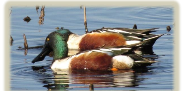
Northern Shovelers, males

Donnelly WMA, Bear Island, Santee Coastal Reserve, Santee Delta, and Huntington Beach State Park