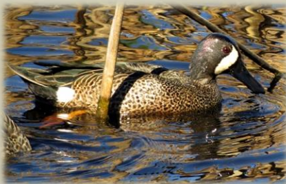
Blue-winged Teal, male