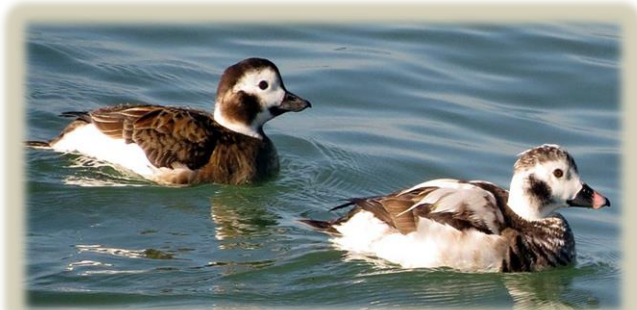
Long-tailed Ducks, first winter