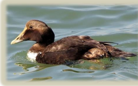
Common Eider, female